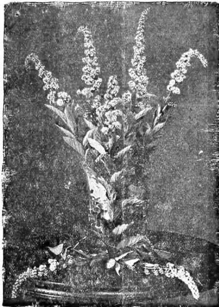
SPIREA TOMENTOSA ALBA.